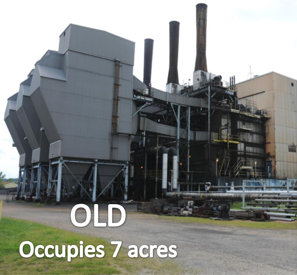
OLD Occupies 7 acres