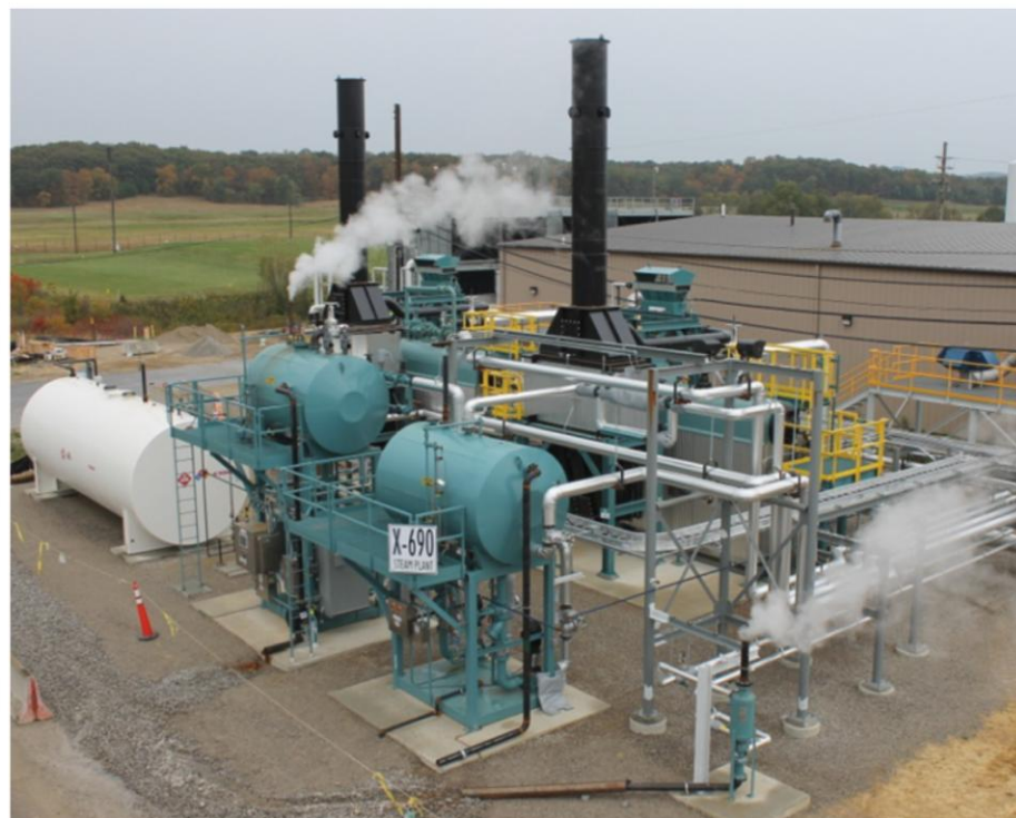
NEW Occupies ¼ acre